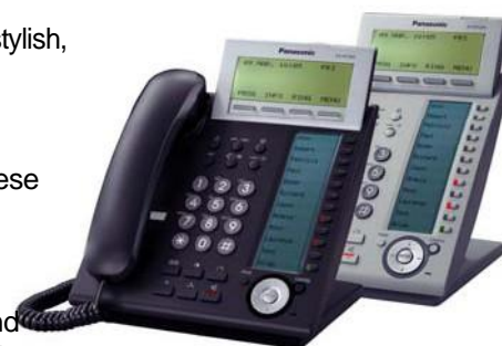
KX-NT300 series IP Proprietary Telephones

The IP telephones offer superb voice quality thanks to handsfree speakerphone and acoustic echo cancellation. The sleek, ultra-modern design, available in both black and white works well with any work environment and office decor.