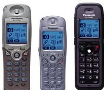
KX-TCA series DECT wireless handsets

The KX-TDE PBX supports wireless mobility solution via an integrated Multi-Cell DECT System. This system provides automatic hand-over between installed wireless cells - enhancing coverage and giving you true communication mobility even across large premises.